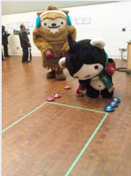
Miga and Quatchi go curling!