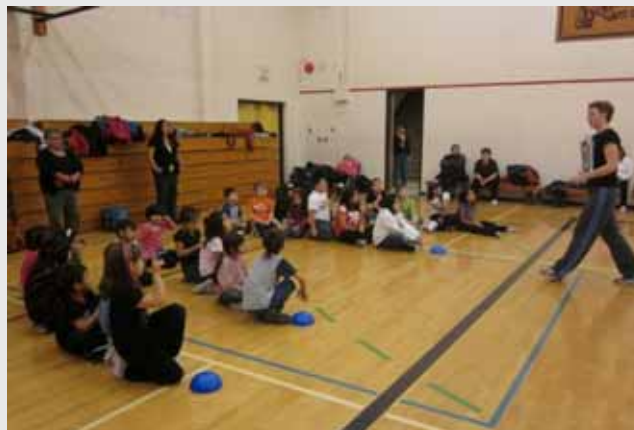
Northwest: New Aiyansh aboriginal community