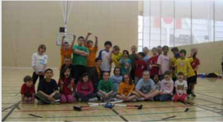
Kamloops: March Break camp at PacificSport