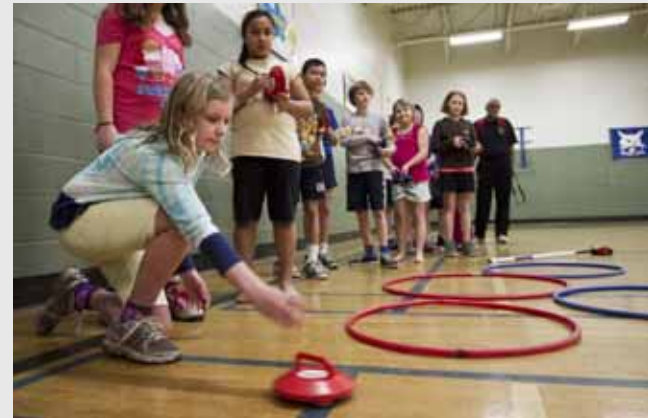
Victoria: Braefoot Elementary